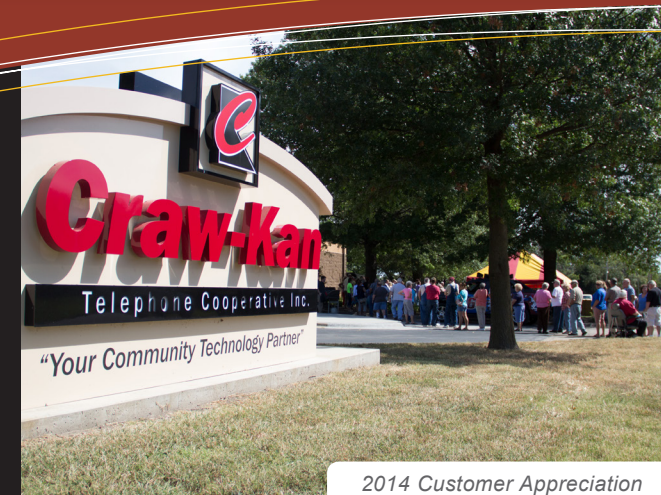
2014 Customer Appreciation